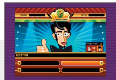
Samples of Composica Mind Games

Programming-free, web-based and easy-to-use, Composica Enterprise is everything you need to maximize course creativity and learner performance.